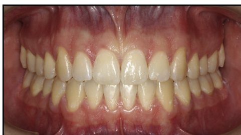
Fig 2. Normal dentition with no missing teeth.