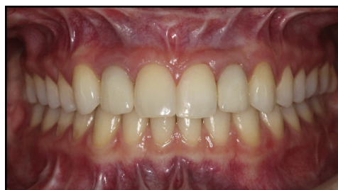
Fig 5. Bilateral implant-borne crowns replacing both maxillary lateral incisors.