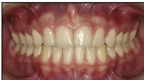
Fig 1. Space closure with canine substitution for a missing maxillary right lateral incisor and compensatory extraction of the maxillary left first premolar. The right canine has undergone enameloplasty, bleaching, and composite bonding.