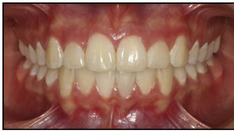
Fig 7. Normal dentition with no missing teeth.