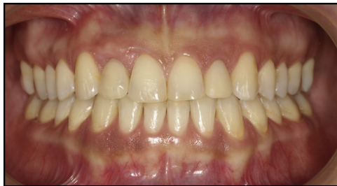
Fig 9. Unilateral implant-borne crown replacing the missing maxillary right lateral incisor.

adjective pairs were arranged according to a random number table as described by Armbruster et al. 27,28 The questionnaires were distributed and completed by dentists and orthodontists attending national dental and orthodontic meetings, with permission from the organizing committees, and by randomly selected patients and their relatives with different socioeconomic (middle to upper class) and educational backgrounds (high school and university diplomas) from the authors' orthodontic offices. All respondents were of the same race, ethnicity, and culture.