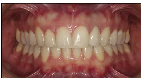
Fig 3. Implant-borne crown replacing the maxillary left lateral incisor.