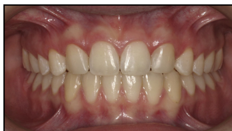
Fig 6. Bilateral space closure with canine substitutions of the missing maxillary lateral incisors. The canines have undergone enameloplasty, bleaching, and composite bonding.

dental work with the same digital camera with a resolution of 1280 \times 960 pixels and matched in size and color using Dolphin software (version 11.7; Dolphin Imaging and Management Systems, Chatsworth, Calif).