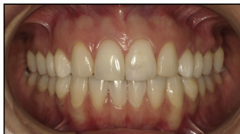
Fig 4. Space closure with bilateral canine substitutions of the missing maxillary lateral incisors. The maxillary canines have undergone enameloplasty, bleaching, and composite bonding.